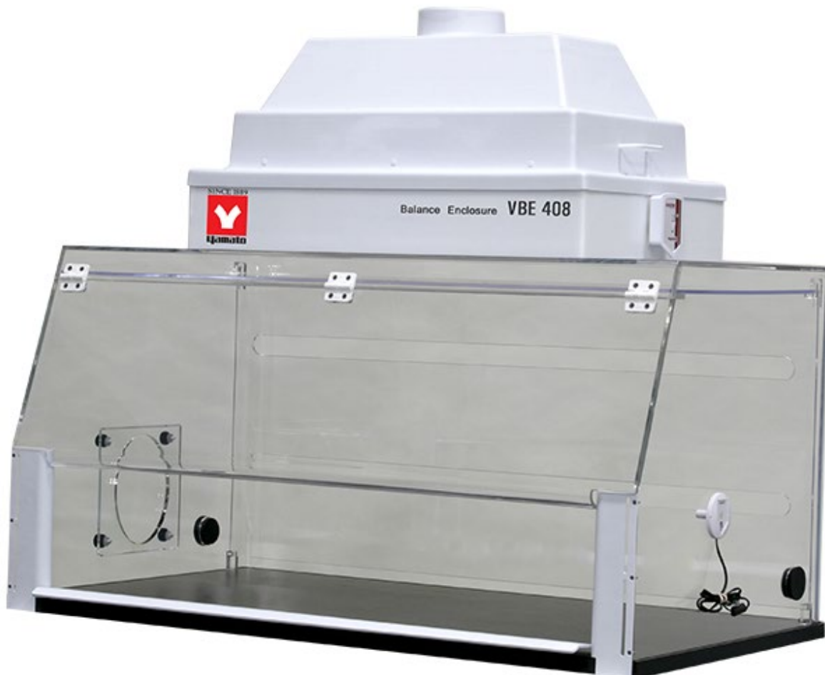
VBE480 Vented Balance Enclosure (front view)

During normal operation, the backward curved impeller maintains a face velocity into the enclosure which prevent particulates from escaping. The impeller pulls air into the enclosure, through the back baffle and then through the HEPA filter. Any particulates that are generated inside the enclosure are swept away from the operator and into the back baffle. The air flow alarm continually monitors the face velocity and alarms when air flow deviates -20% from target face velocity.