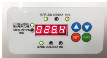
● Control panel