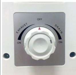
● Drain valve