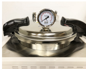
● Pressure gauge