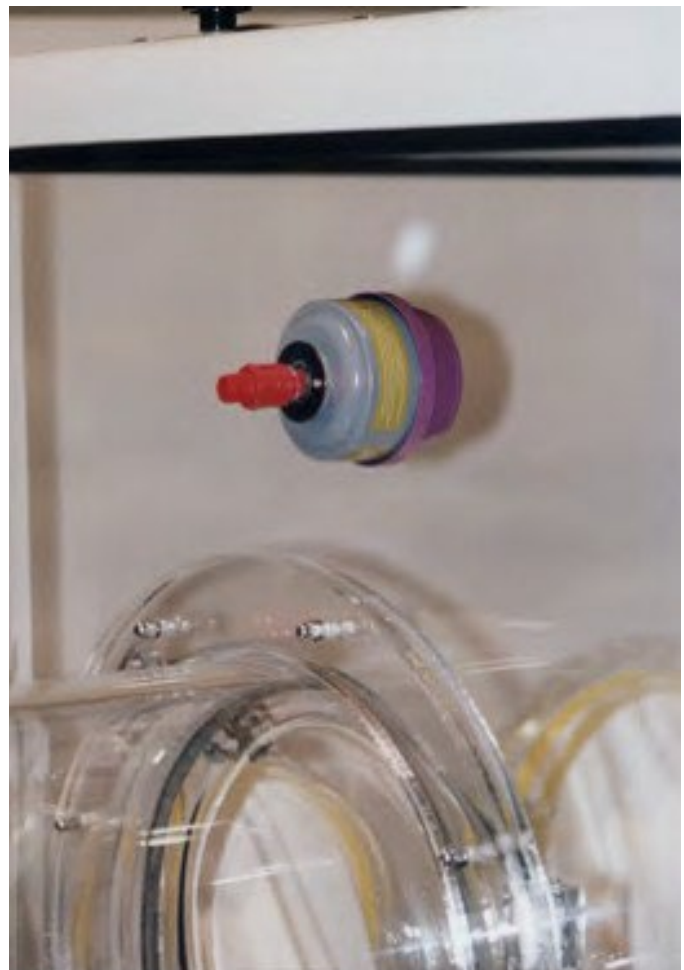
Close-up view of new filter mounted inside (Part no. PLA-830ABC)