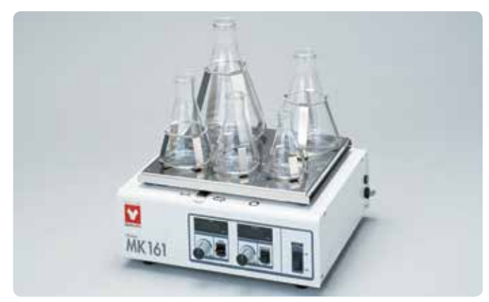
Example of using mounting stage and erlenmeyer flask holder clamps (optional)