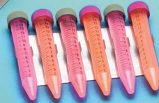
Fig. 4, 7