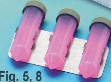
Fig. 5, 8