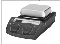
C-MAG HS 4