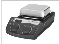
C-MAG HS 4