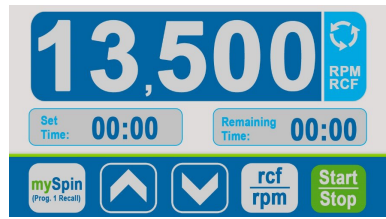
Figure 1 MyTouch™ Control Panel Layout

Tubes to be loaded should be filled equally by eye. The difference in the weight between the tubes should not exceed 0.1 gram. Tubes should always be loaded so that there is equal spacing between all tubes. One or two additional loaded tubes may need to be added to achieve this.