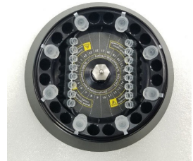
Figure 2 Balanced Rotor Load