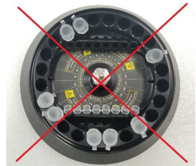
Figure 3 Incorrect Rotor Load