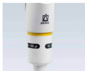
Integrated shaft coupling