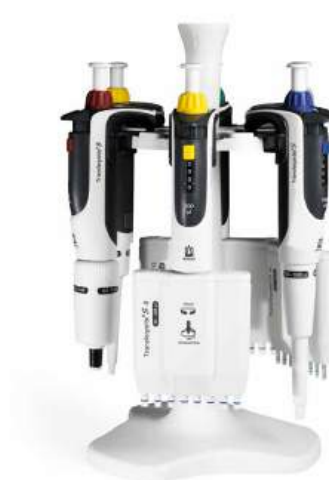
Bench top rack for 6 Transferpette® S single- or multi-channel pipettes.