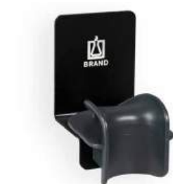
Wall mount for 1 Transferpette® S single- or multi-channel pipette.