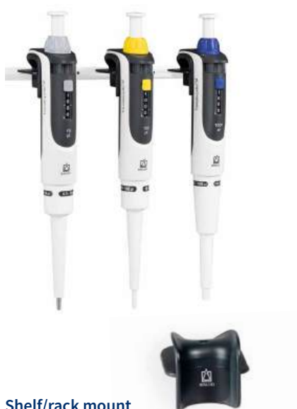
Shelf/rack mount for 1 Transferpette® S single- or multi-channel pipette.

With holders and stands, the devices are always properly stored and close at hand for the next application.