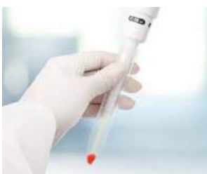
Narrow centrifuge tubes

Individual nose cones and seals can be easily removed for cleaning or replacement