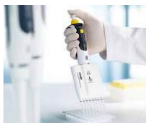
Working with PCR plates