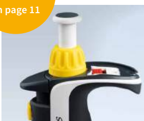
Easy Calibration technology