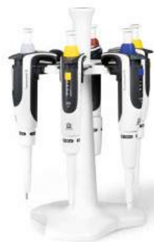
Pipette Package 2