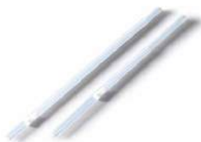
Telescoping filling tube FEP