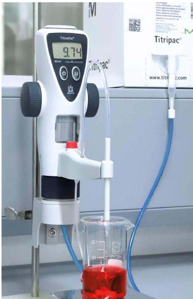
Titrette® extraction system for Bag-in-Box (Titripac® is a registered trademark of Merck KGaA, Darmstadt, Germany)