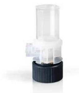
Dispensing cylinder with valve block