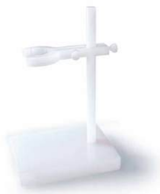
Bottle Stand PP. Full plastic construction. Support rod 325 mm, base plate 220 x 160 mm, weight 1130 g