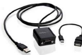
Adapter set interface interface RS232 to USB for Titrette®