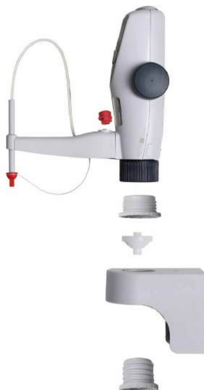
Extraction system for Titrette® extraction system for Bag-in-Box for ready-to-use volumetric solutions