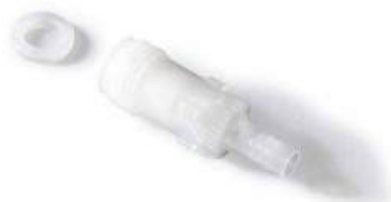
Filling valve with olive-shaped nozzle and sealing ring