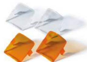
Inspection window 1 set colorless and 1 set amber colored (light shield)