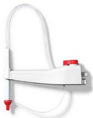
Titrating tube with screw cap and integrated discharge and recirculation valve

Find more information on the Titrette® and suitable accessories at shop.brand.de