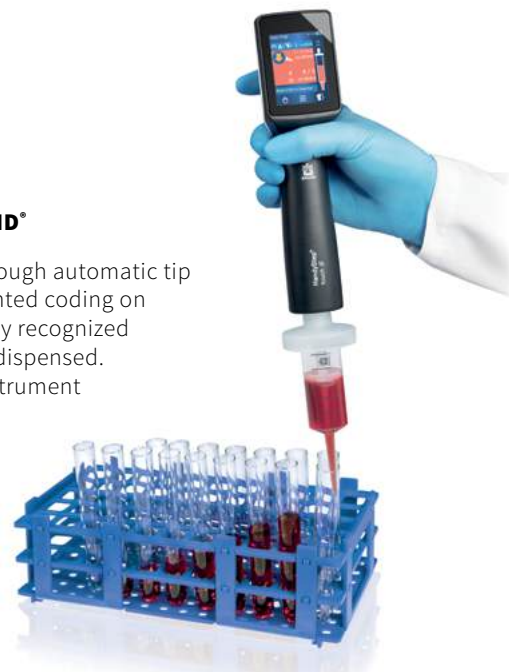
Sequential dispensing with the HandyStep® touch S and PD-Tip™ //