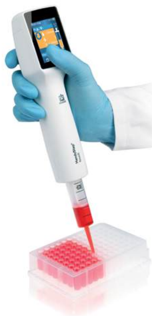
Multi dispensing with the HandyStep® touch and PD-Tip™ //

The HandyStep® touch saves time and prevents errors through automatic tip size recognition of the PD-Tip™ // from BRAND®, with patented coding on the pistons. After inserting the tip, the size is automatically recognized and displayed, making it easy to select the volume to be dispensed. When a new PD-Tip™ // of the same size is inserted, all instrument settings are maintained.