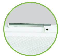
The key lock on the handle is a standard feature in our LTF 85 for optimal security for your samples.