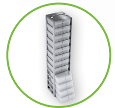
Optimal storage capacity and overview of the stored samples with the stainless steel front rack storage system