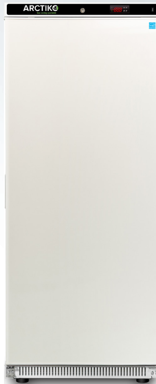
LFE 285-US ▲